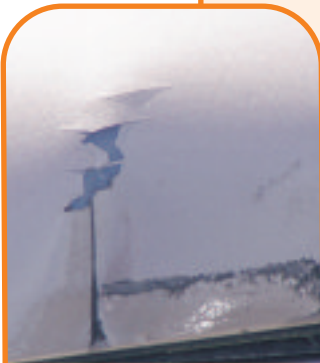
Unacceptable Cars and Commercials