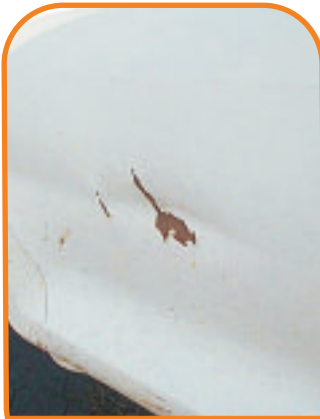
Unacceptable - Cars