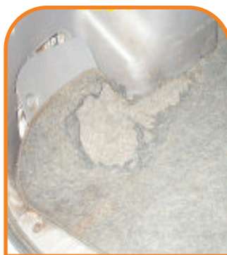
Unacceptable Commercials (some damage is expected in this area)